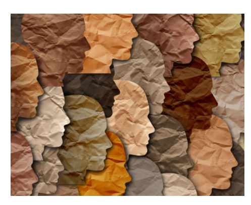
Black History Month