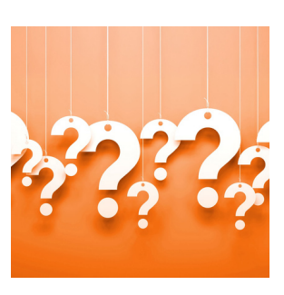
5 Key Questions to Test Retirement Knowledge* Visual Insights Newsletter