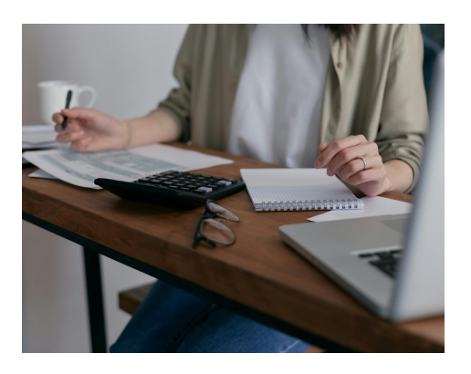
Tax Season Prep

No time to create your own content? No problem, check out our suggested ready-to-go campaigns on Page 4.