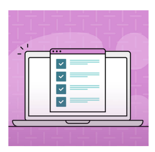
The Surprising & Undeniable Power of Simple Lists in Financial Planning