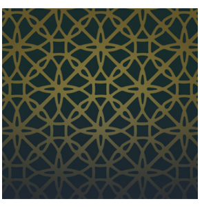
Hidden Tax Opportunities Lead Generation Campaign